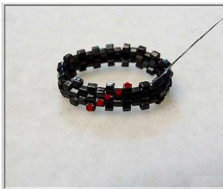
2) Make 5 rows in peyote stitch with DB10.