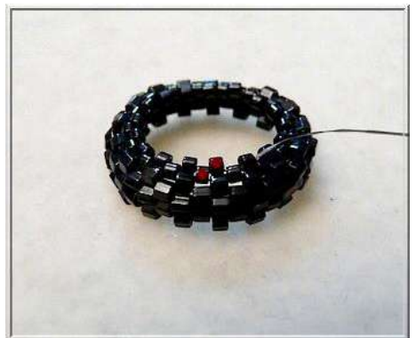
3) Make 2 rows in peyote stitch with DB11.