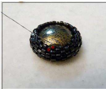
5) Make 2 rows in peyote stitch with DB11.