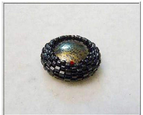
6) Make 1 row in peyote stitch with DB15.