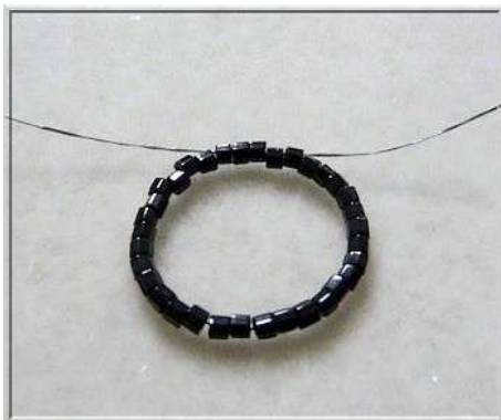
1) Pick up 34 DB10 and close.